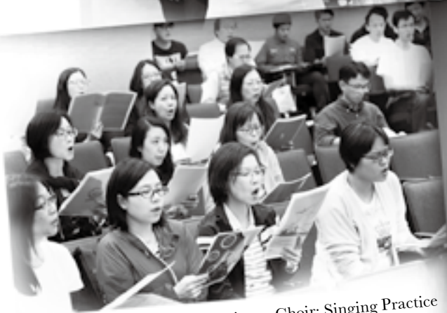
Seminary Choir: Singing Practice