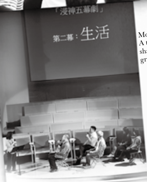
Morning chapel: A thanksgiving sharing from the graduating class

HKBTS needs intercession and donation support from our churches and brothers and sisters.