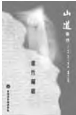
Theme of issue 34: Spiritual Care