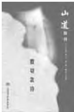
Theme of issue 35: Hospitality