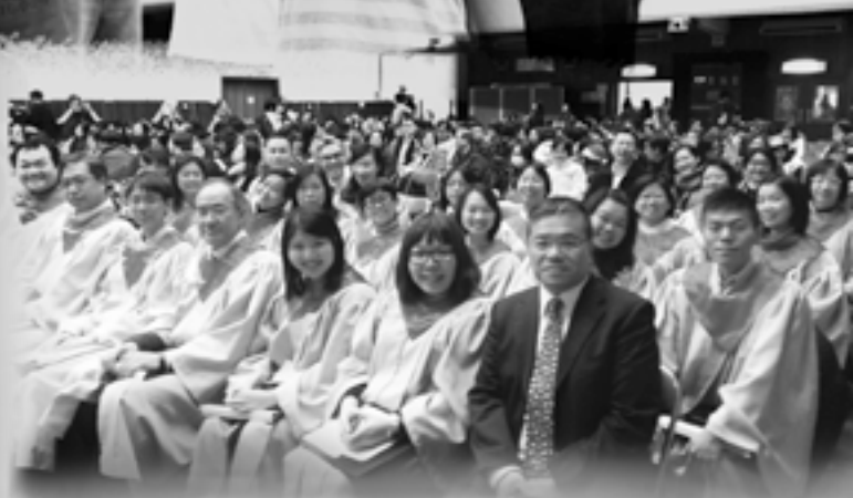
Dec 24, 2013 Christmas Caroling at Ma On Shan District