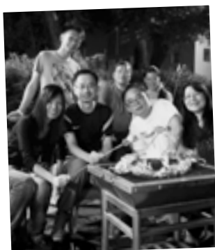
Sep 18, 2013 Celebrating the Mid-Autumn Festival: Teachers-and-Students' BBQ