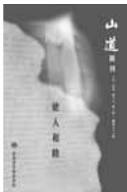
The theme of issue 33: Peacemaking