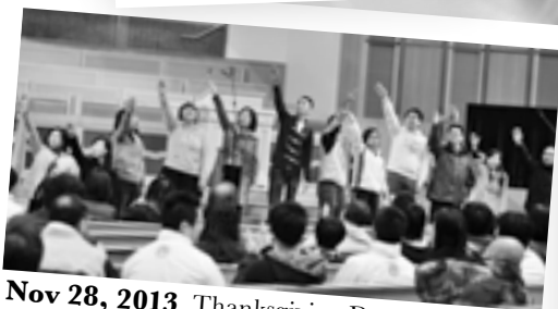
Nov 28, 2013 Thanksgiving Day: Offering Thanksgiving with Songs of Praise