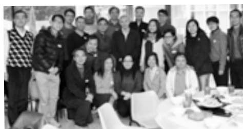
Dec 16, 2013 The Master of Theology Class: Teachers and Students Lunch Together