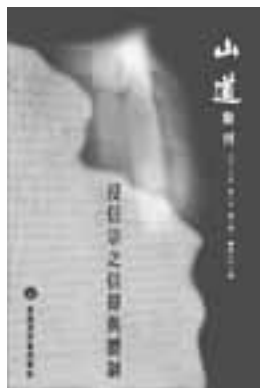
The theme of issue 32: Baptist Faith and Polity