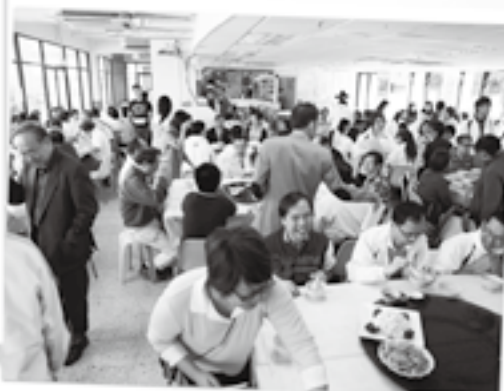
November 22, 2012 Thanksgiving Day: Feasting Together