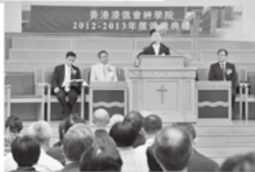
May 23, 2013 Awards Ceremony: A Vote of Thanks by the Student Representative