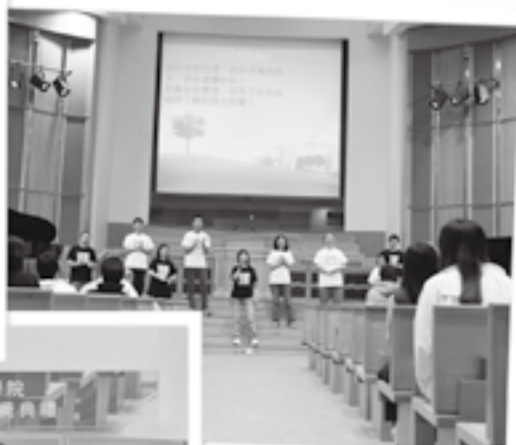
May 8, 2013 Morning Chapel: Sharing from Graduating Students from the BAPS Program