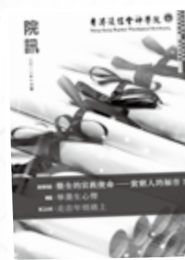
Chinese / English Newsletter (published quarterly)