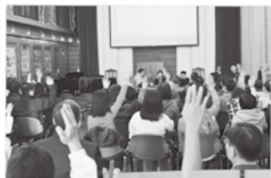
January 24, 2013 Annual General Meeting of the Student Union: Casting Votes Together