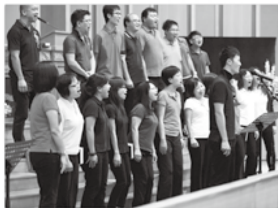
September 5, 2012 Morning Chapel: Sharing about an Exchange Visit to Wuhan by the Seminary Choir, "Hill Road"