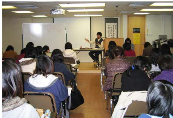
▼ LTED: A Christian Ethics class

In the last school year, LTED offered 10 programs allowing students to earn certificates, diplomas, bachelor and master degrees. The programs include Christian Studies, Lay Theological Training, Women Theological Training, Elderly Ministry, Youth Ministry, Childhood Ministry, Early Childhood Ministry, Sports Ministry, Mission Ministry, Church Administration and General Affairs. Last year, LTED launched the Childhood Ministry Program, providing training for those ministering to children aged from 6 to 11 at church or in school. The program provides a holistic and systematic