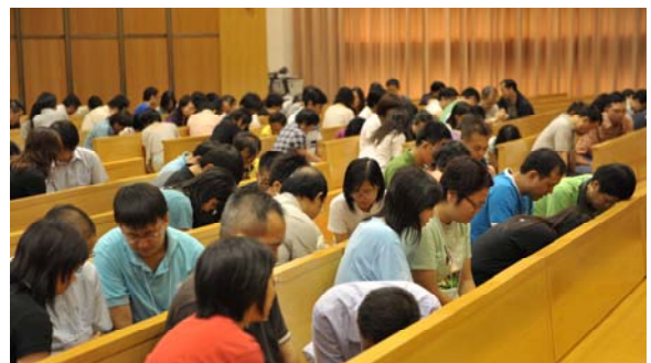
▼ All-Seminary Prayer Meeting