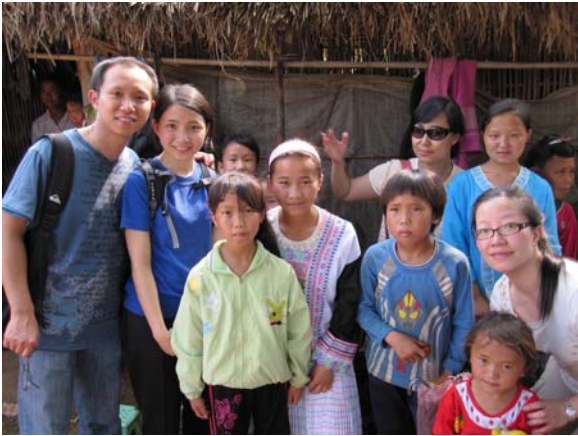
▲ Summer Visit and Exchange Tour to Jiangxi

Beyond our campus, God continues to offer opportunities for Christians to consecrate themselves to him and to learn more about the Seminary. These Christians are invited to attend the “Talk on Full Time Ministry” and the “Experiencing Seminary Life Camp.” The Seminary is blessed to hold Seminary Sunday Worship in 38 churches where our teachers are invited to share messages and inform congregations about HKBTS.