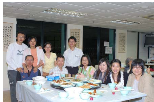
▼ Student Union Activity: Parents' Day