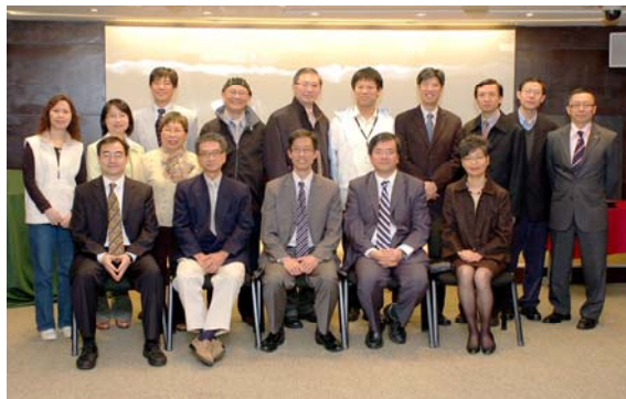
▲ Executive Training for Christian Leaders: The Third Graduation Ceremony

Christian community and in the society. Lecturers are Christians with years of executive experience in management and the lessons are conducted in the form of lectures, case studies and workshops. Students are led to use resources effectively, to make good use of personal strengths and to carry out their God-given mission with greater strength. Since the beginning of the program in October 2007, 53 people have graduated from the program. The fourth class will begin in October this year.