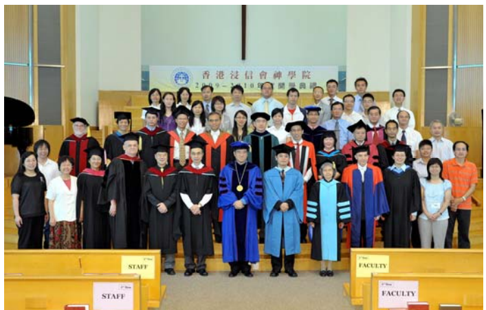
▲ The faculty and new students at the Opening Convocation

In the Faculty Retreat, we strongly experienced God's presence and we understood the importance of stepping forward with one accord on the Seminary's road of solid, steady development. As all the faculty looked to God and discussed future teaching strategies and directions, we became aware that God had filled our hearts with the same mind. At the same time, we experienced a strong sense of mutual trust, harmony and unity among our faculty members.