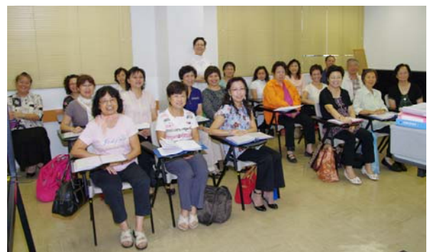
▲ Teachers and Students of the Appreciation of the Songs and Lyrics of Cantonese Hymns class

“Appreciation and Analysis of Indigenized Hymns Lyrics” which explores the relationship between local dialect and the composition and singing of hymns. The center also offers day and evening courses, which include vocal performance, keyboard music, music appreciation, choral music, conducting, Chinese and western musical instrument performance, dance, drama and theater, cinema and regional opera classes.