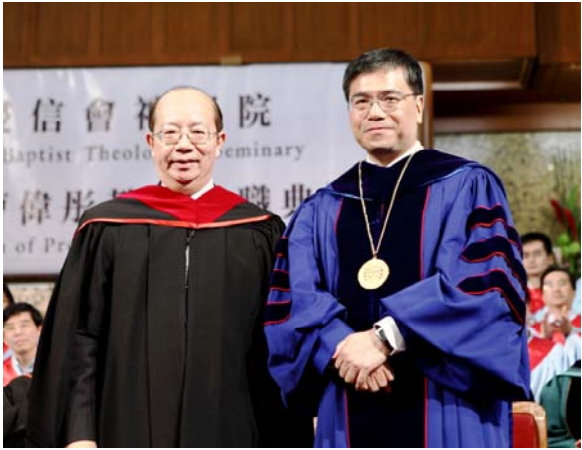
▲ The Inauguration of the Sixth President