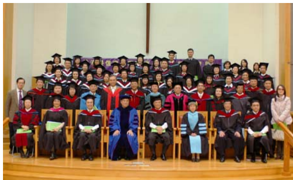
▲ LTED Graduation Ceremony 2009

Apart from regular programs, we also organize a variety of topical seminars, equipping lay Christians to reflect upon their Christian faith in light of the current challenges of the world. Some of these topical talks were held in students' regular meetings. Through the input of Christian professionals, students broadened their vision and deepened their understanding. A total of 12 such talks were held over the past year. We thank God for the large number enrolled in our programs each quarter and for the participation in our seminars last year. The average number of students in the programs each quarter was 915 in the past while the total number of people enrolled recently in the programs and joining the talks each quarter averaged over 2,600.