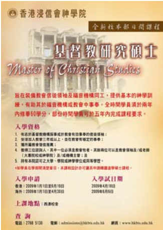
▲ The newly launched Master of Christian Studies Program

launched a new program: the Master of Christian Studies Program. This program aims to train lay church leaders and staff in para-church organizations by equipping them with basic theological training. Then, in our effort to meet the needs of the pastoral ministry, we have made a small-scale revision of the Master of Pastoral Counseling Program. The result is that the spirituality dimension has been strengthened, enabling students to integrate spirituality elements into their pastoral counseling ministry.