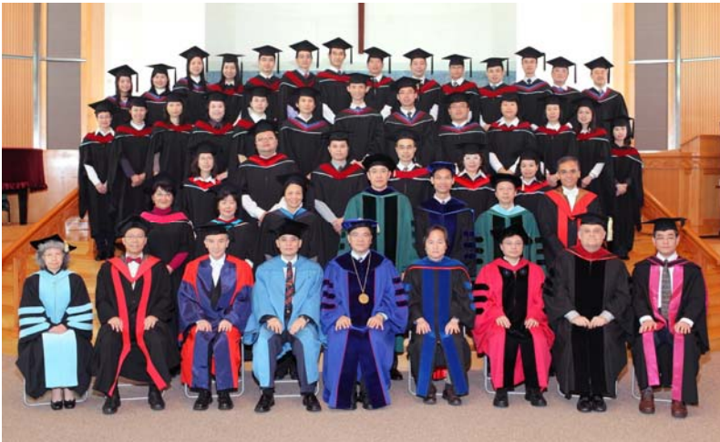
◀ The 58 class of graduates from the Ministerial Training Program