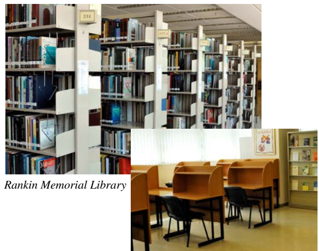
Rankin Memorial Library

Thank God for granting our students a library so rich in resources, with a spacious and comfortable reading environment. Until August this year, the total size of the collection of our Rankin Memorial Library had reached over 105,000 items, including over 82,000 Chinese and English books, 9,400