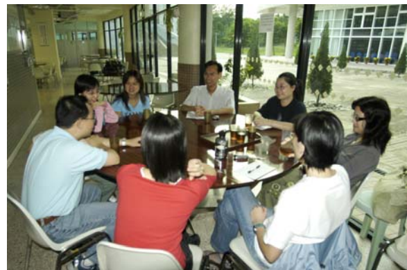
▲ The Spiritual Formation Group Meeting