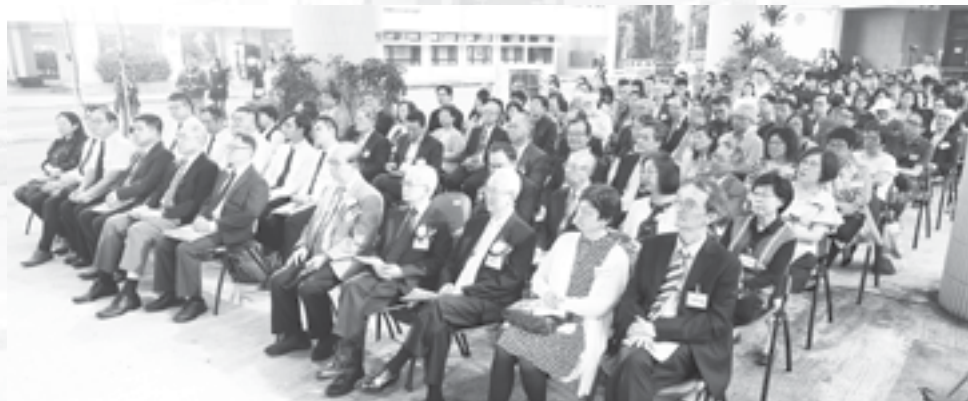
It was a full house at the ceremony.