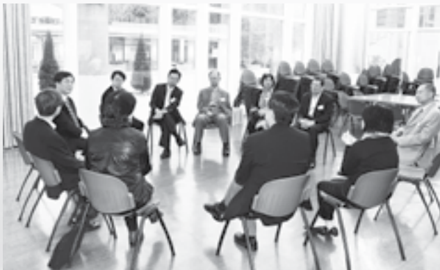
The annual meeting of the President's Council on February 28, 2009.

First established in the 1980s, the President's Council of the Hong Kong Baptist Theological Seminary (HKBTS) was less active then and the council members met less frequently. It was not until 2009 when I started to convene members of the Council for regular meetings each year that the situation began to improve. I am glad to see the team beginning to gel and functioning well over the past ten years. Now passionate discussions frequently occur in meetings and our council members are enthusiastic in contributing ideas generously as we all bond and grow closer together.