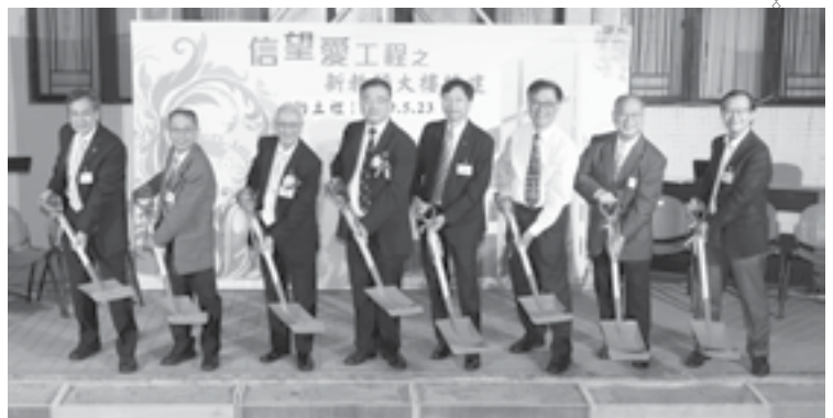
The members of the Building Committee and the Campus Environment Consultation and Development Committee were pictured after the ceremony.