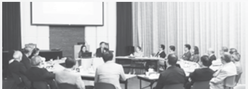
The annual meeting of the President's Council on April 13, 2019.

How blessed is HKBTS to be endowed with such a dedicated team of council members in expanding the ministry of God!