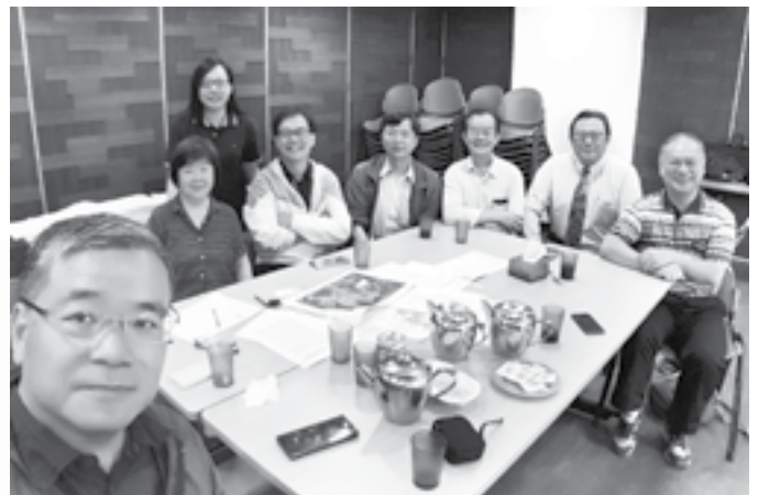
One of the early morning meetings

As committee members have their day jobs, and administrative staff members of the seminary were busy preparing for the new school term, we scheduled to meet at 7:30 in the morning so that everybody may go to work afterward. Since then we have always scheduled our meetings at 7:30 am. Though the issue we have to deal with is no easy matter, the meetings are always held in a pleasing atmosphere. One of the committee members once told me, "The meeting at 7:30 in the morning is indeed also a prayer gathering." What he meant is that we discuss God's work with a prayerful heart.