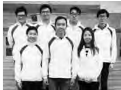
Executive Committee members of the Student Union 2018