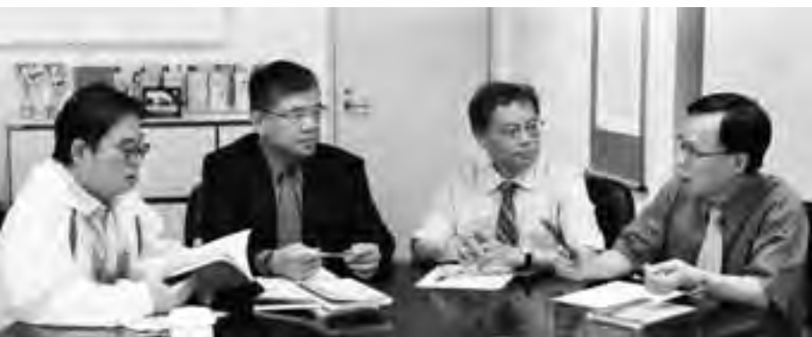
Hill Road Journal Editorial Committee Meeting in progress

Furthermore, those teachers and I on the Editorial Committee have a lot of mutual understanding and joyful cooperation. As each issue of HRJ has a designated theme, we first decide on the theme and then seek appropriate contributors to write 5 to 6 articles to explore this theme from different perspectives. Every time the Editorial Committee comes together to decide on the theme for an issue, it is not hard for us to come to a consensus. Sometimes, we can choose the themes for the next 2 to 3 issues in just half an hour. What is more incredible is that, one time, it only took us five minutes to discuss and choose the theme and the perspectives to approach the theme. In addition, I am also pleased to see that our teachers are willing to write for HRJ with neither difficulty nor reluctance. Our teachers and scholars (regardless