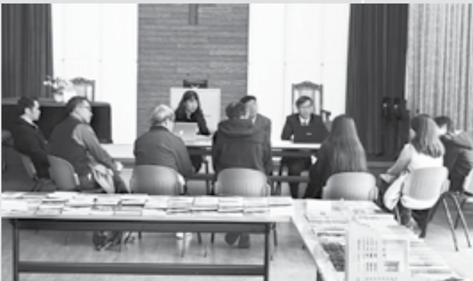
The accreditation team met with recent alumni.

Three accreditors from the Association of Theological Education in South East Asia were on campus to once again assess the academic standards of the seminary's degree programs. Besides the Doctor of Theology Program that was launched in 2013 (the seminary did not apply for accreditation because we do not have any graduates), all our degree programs (Main Campus Program and the Lay Theological Education Department) have been re-accredited. The accreditors ranked the seminary high in terms of academic level, curriculum structure, amenities, administration, financial resources, and communication effectiveness.