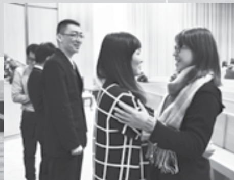
After the morning chapel, local students came to shake hands and share their appreciation.