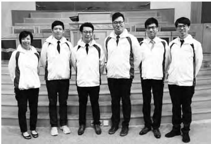
A new term of Executive Committee of the Student Union 2017