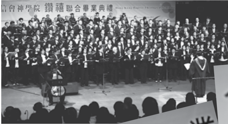
The Joint Choir sang "A Prayer of Thanksgiving"