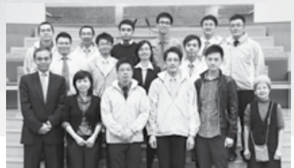
Student Union's new Executive Committee members 2012