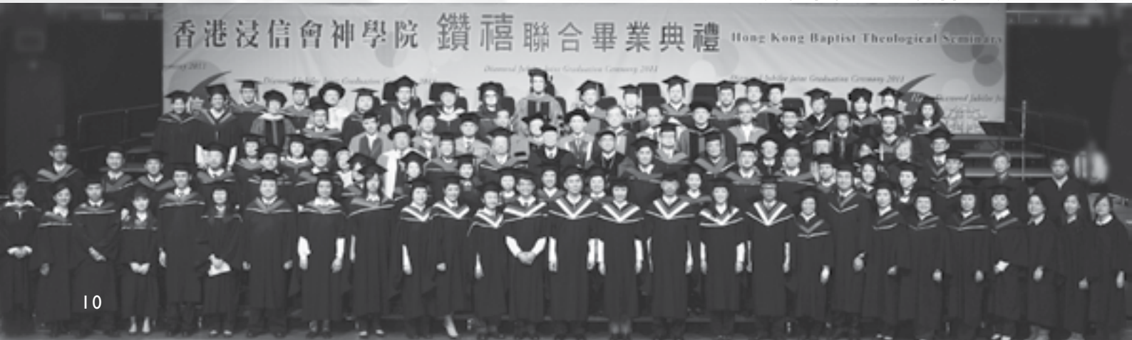
Graduates of degree programs took a group photo after the ceremony

In 2011, there were 56 graduates of degree programs and 292 of diploma and certificate programs. We praise the Lord that around 3,000 guests attended the ceremony and joined us as we offered thanksgiving and praise to God.