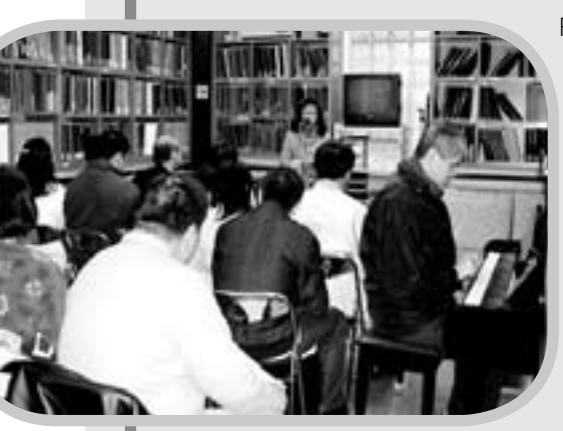
Convocation of the "Spiritual Light Project"

Christ in the correctional institutions. We hope that through these programs, these believers can experience God's love and their Christian lives can mature.