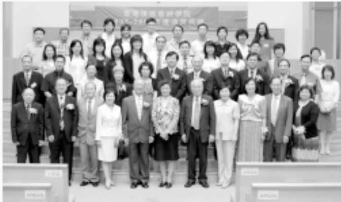
Those presiding at the ceremony, the donors, the award-winning students, faculty members, staff and retiring staff receiving long-service awards were photographed after the ceremony.